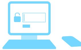
Publicly accessible computers