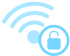
Unsecured Wi-Fi networks

Business travelers are prime targets for cybercriminals , as they often carry valuable data and may not always be careful about securing their devices. Some common cyberthreats that business travelers may encounter include: